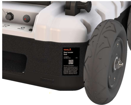
Label with information on serial number and QR code.

For further instructions see; MALÅ Controller App User Manual or MALÅ Controller App Quick Guide .