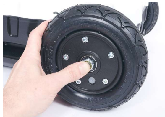
Press the quick release pin and pull the wheel to remove.

See RTC Mini Quick guide for more information.