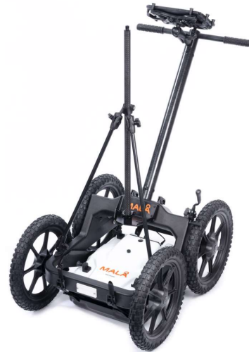
RTC Mini with optional GPS/Prism attachment

The RTC Mini is an off-road rough terrain cart that enables the use of the Easy Locator Core in areas of uneven terrain.