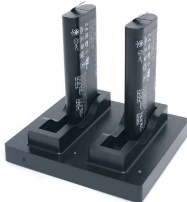
External dual battery charger

The batteries are charged in an external RRC charger, where both batteries can be charged at the same time.