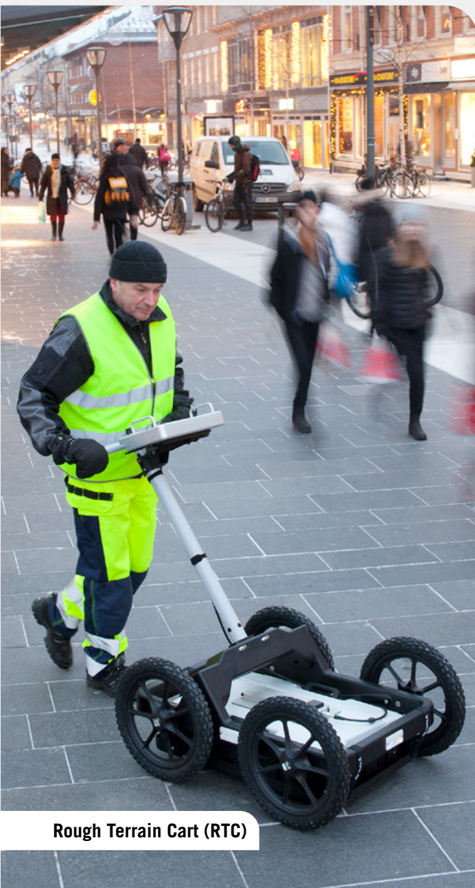
Rough Terrain Cart (RTC)

The choice of antenna frequency will be governed by your application and the desired depth penetration and resolution. All new MALÅ Ground Explorer antennas are app-enabled, and come with WiFi connection per default. This enables full integration with MALÅ Controller app and MALÅ Vision.